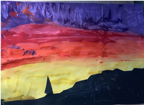
This half terms adventures and learning